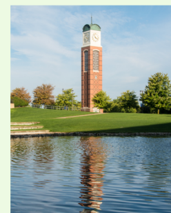
a GVSU campus scene

Check us out and apply at www.mathpath.org